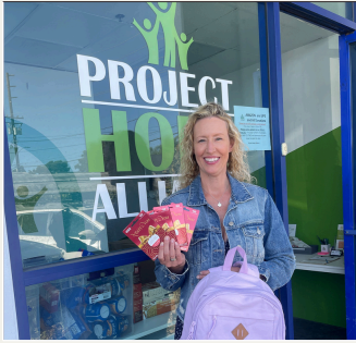
JULY: BACK TO SCHOOL DRIVE