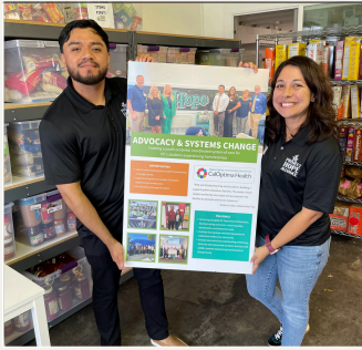
OCTOBER: 4 TH ANNUAL OPEN HOUSE