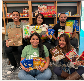
NOVEMBER: THANKSGIVING FOOD DRIVE