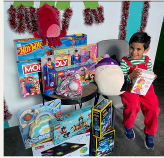
DECEMBER: HOPE FOR THE HOLIDAYS